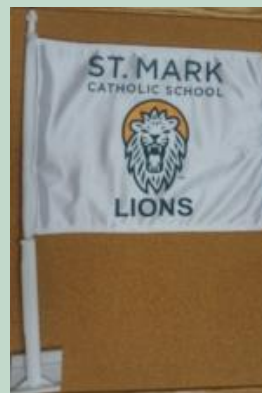
Car Flag - $18.00