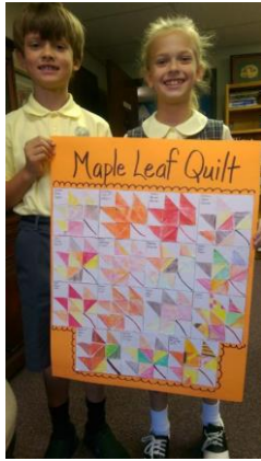
7th Grade Literature Circles: