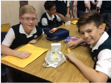
7th Grade Science: