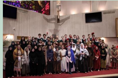
LLS/Olive Garden Lunch: