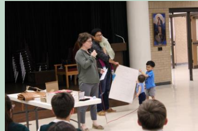
Living Stations of the Cross: