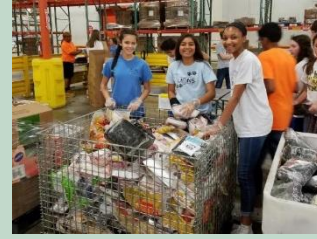
Auction Birthday Party:

Click the following link to submit your update: https://stmarkplano.org/2017-parish-update-form . It only takes a minute.