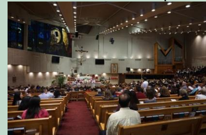
8th Grade Day of Service: