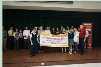
Principal Appreciation Day: