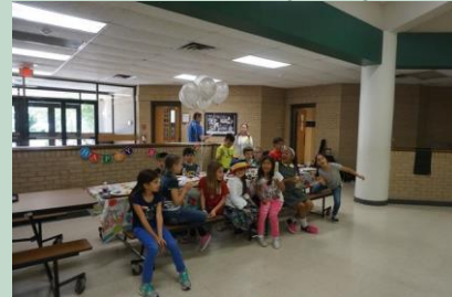
PK3 - "X" Marks the Spot: