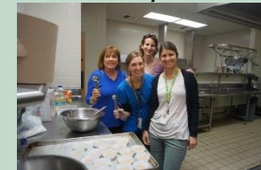
8th Grade Auction Party: