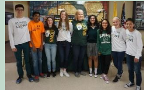
PSIA State Competition: