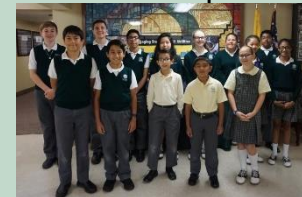
Robotics in The Texas Catholic :