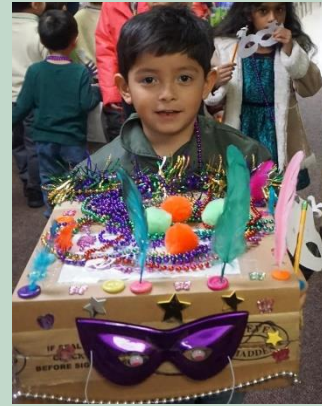
Ash Wednesday Mass: