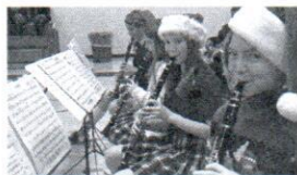
SCHOOL BAND CONCERTS