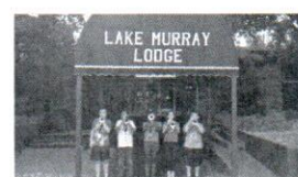
BAND CAMP AT LAKE MURRAY