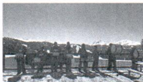
SPRING CONCERT TOUR