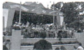
SIX FLAGS PERFORMANCE