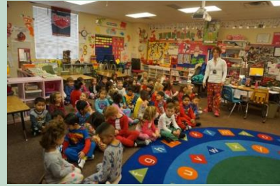
Middle School Hour of Code: