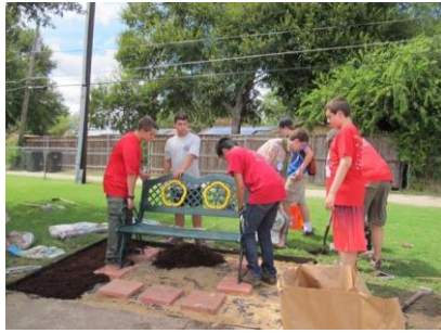
Community Prayer Team Meeting: