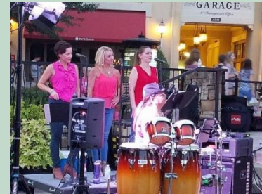
5th Grade Sculpture Shadows: