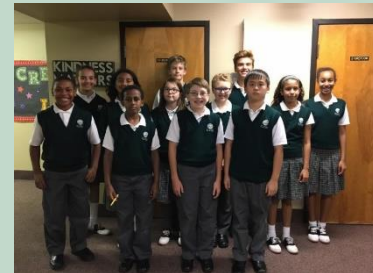
Preschool Texas Day: