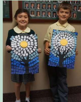
Choctaw Nation Recognizes Academics: