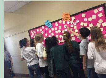
Art History/Jackson Pollock:

*Community Prayer Team Meeting: Monday, April 6, 8:00 AM, Room 116