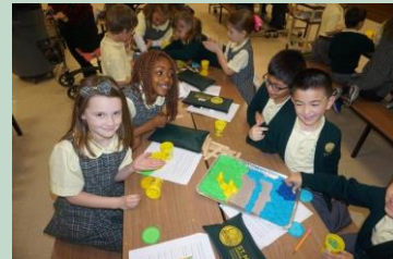
PK4 Humpty Dumpty Magnets: