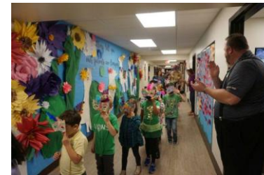
Mardi Gras Parade